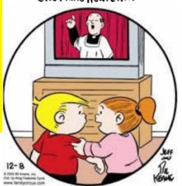
"Hear that? People in heaven have ever-laughing life."